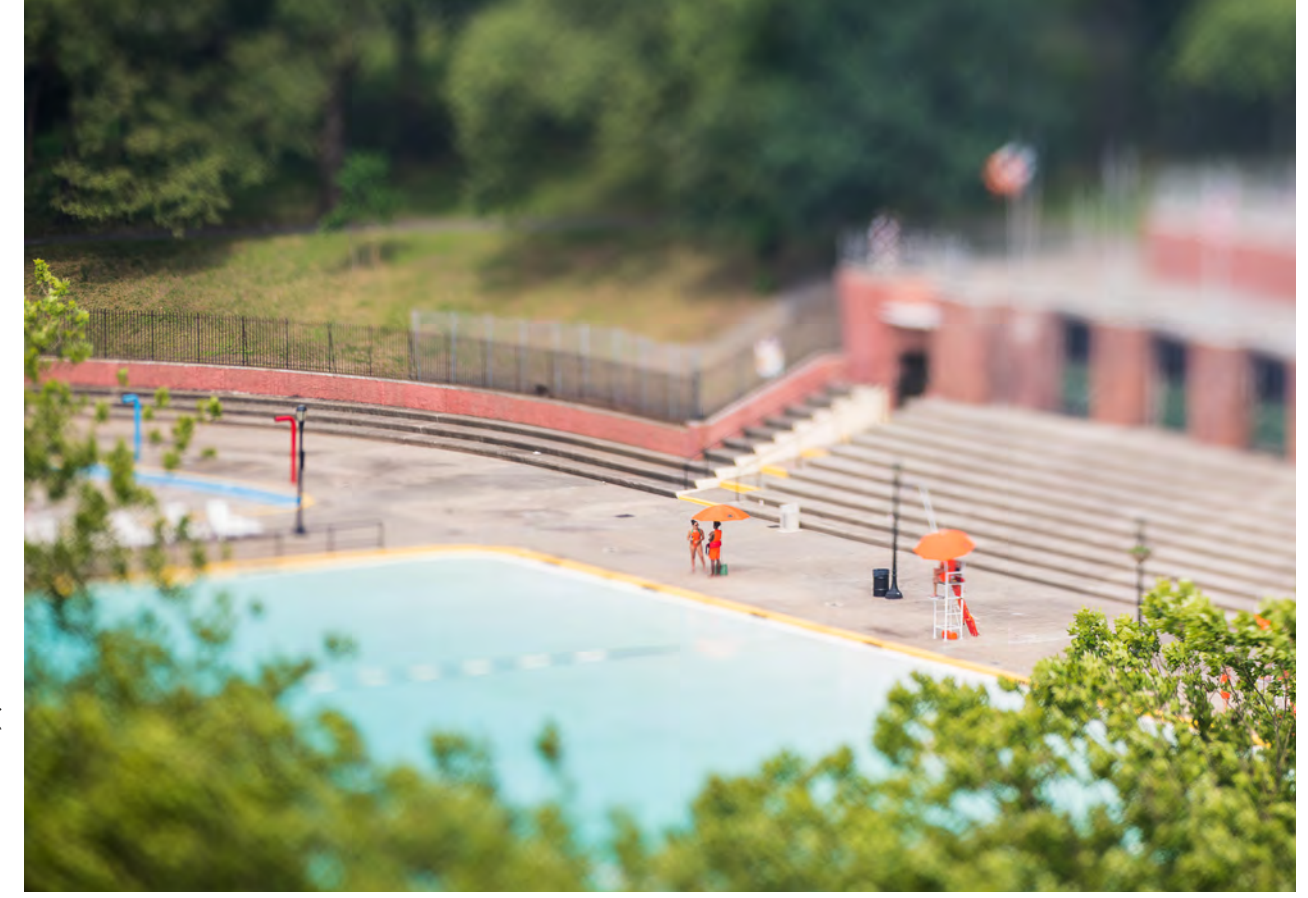
Astoria Park Pool, Queens