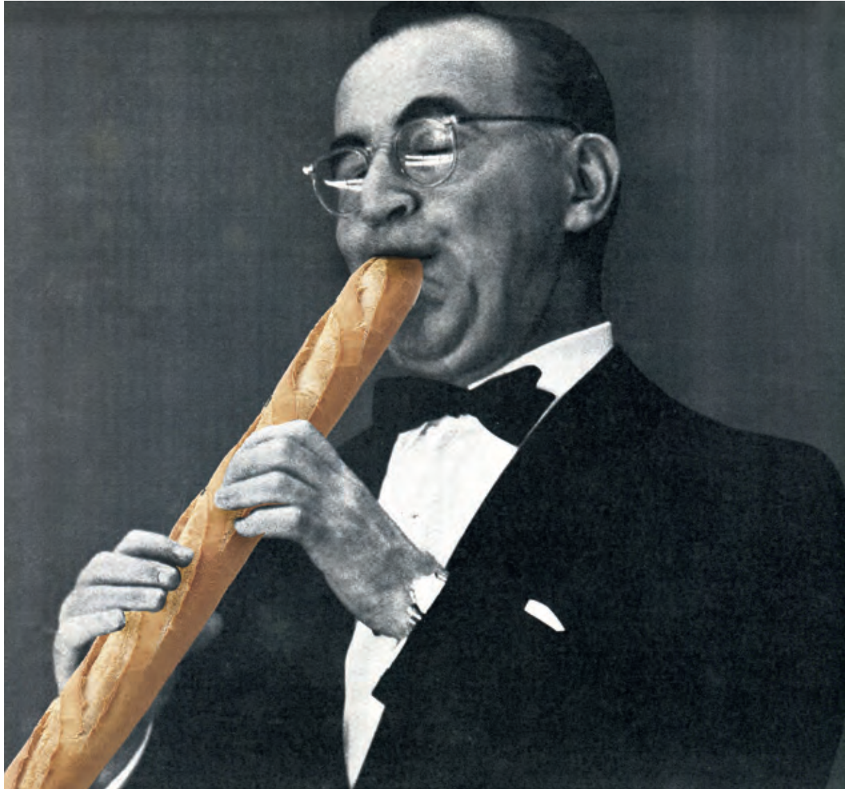
Instrumental – digital – 2015