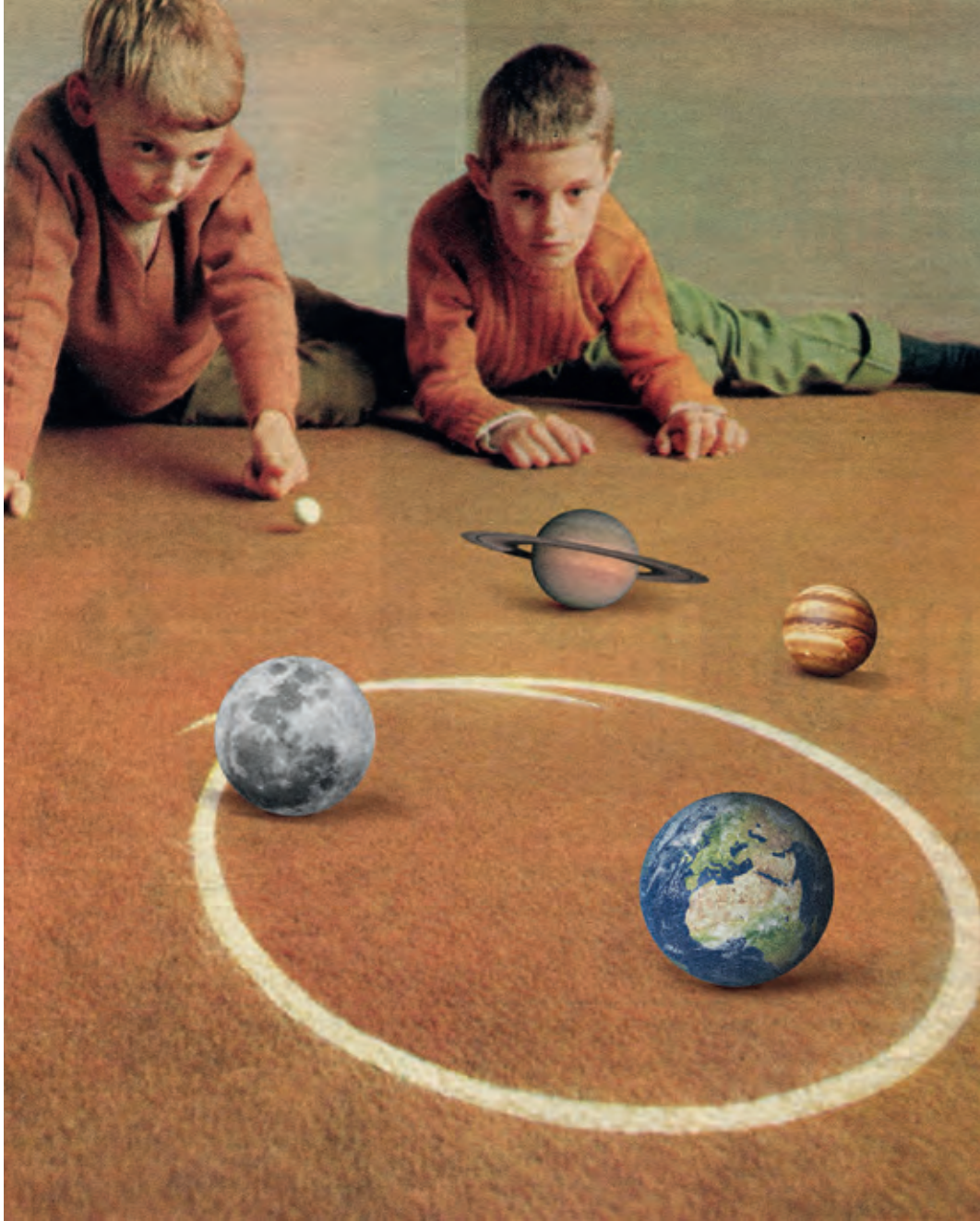
Space to Play – digital – 2016