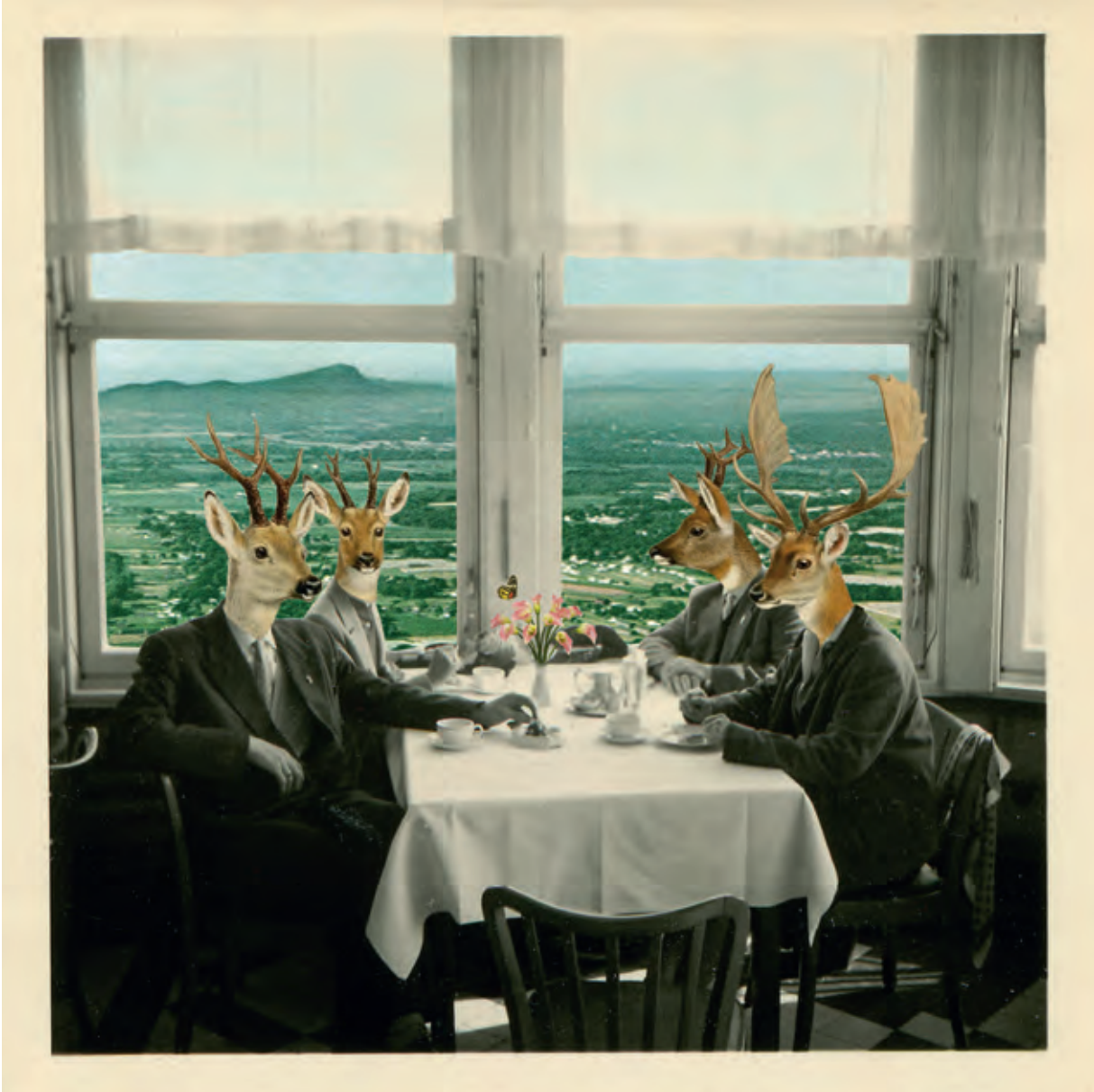
The Gang – digital – 2013