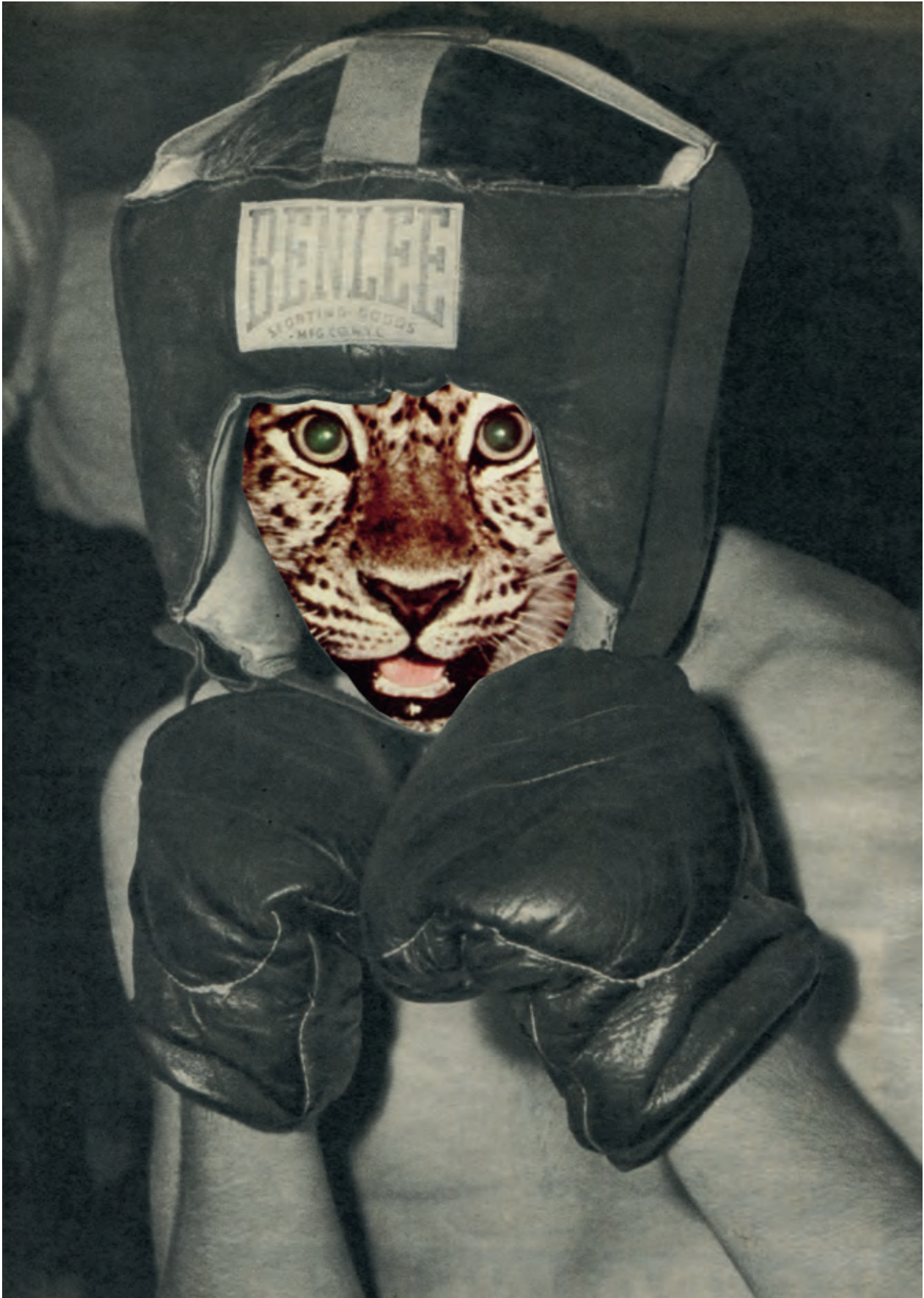
El Boxeador – handcut original – 2014