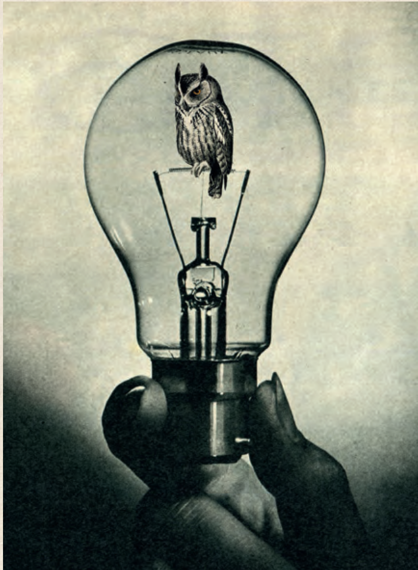
The Night Owl – digital – 2015